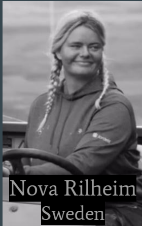
Nova Rilheim Sweden